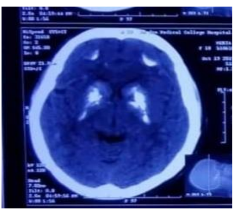
Figure 1 and 2 showing bilateral symmetrical calcification of the caudate nucleus, lenticular nucleus (putamen and globus pallidus), thalamus, paraventricular region and also over both fronto parietal region

She was diagnosed with striatopallidodentatecalcinosis (or Fahr's syndrome) secondary to hypocalcaemia due to Pseudohypoparathyroidism (PHP). As the patient was having no phenotypic abnormalities so type 1 PHP( Albrights hereditary osteodystrophy) was excluded. Differentiation between type 1b, type 1c and type 2 could not be done as there were no facilities for Ellsworth Howard test (urinary excretion of cAMP in response to intravenous PTH) and test to detect GNAS gene mutation. Patient was treated with high dose of calcium carbonate, calcitriol, phosphate binder sevelamer and anti epilepticlamotrigine. During follow up her corrected serum calcium was 9.2mg/dl, s. phosphate was 3.6 mg/dl